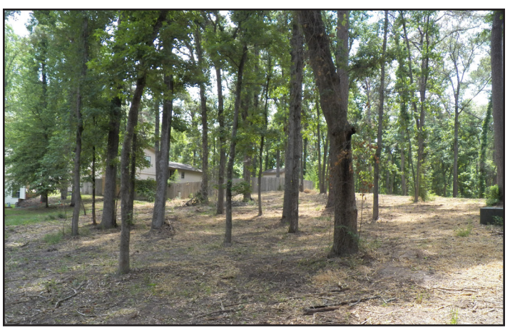
A shaded fuel break is created when trees in a forested area are thinned and pruned, creating a break in vegetation but retaining some crown canopy. A fuel break can reduce fire risks and rates of spread.

"They cracked the code, so to speak, for other communities to tap into this important funding source and follow suit," said Texas A&M Forest Service's Justice Jones.